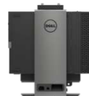
OPTIPLEX SMALL FORM FACTOR ALL-IN-ONE STAND (COMING SOON)

Minimize your footprint with this arm that offers easy installation and enhanced adjustability while keeping cables neatly hidden from view.