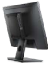
OPTIPLEX MICRO ALL-IN-ONE MOUNT FOR DELL E SERIES MONITORS

Small footprint mounting solution adapts to your environment, with cable management and monitor height adjustability, tilt, swivel and pivot functions.