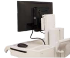
OPTIPLEX MICRO DUAL VESA MOUNT WITH ADAPTER BRACKET

This mount allows the Micro to be VESA mounted to select Dell E Series displays.