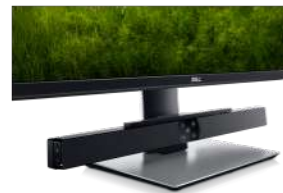
DELL PROFESSIONAL SOUND BAR - AE515M

Optimize your workspace with this efficient 21.5" monitor built with an ultrathin bezel, a small footprint and comfort-enhancing features.