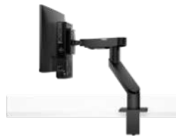
DELL SINGLE MONITOR ARM - MSA20

Mount your system on a wall or under a desk. Includes an adapter box to securely house the system's power adapter.