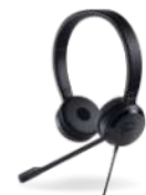
DELL PRO STEREO HEADSET - UC350

Custom dust filters safeguard internal components in factory, warehouse, or retail environments.