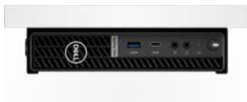
OPTIPLEX MICRO VESA MOUNT WITH ADAPTER BRACKET

Mount your system on a wall or under a surface with a VESA-compatible DVD+/-RW enclosure with full optical drive access. Includes an adapter box to securely house the system's power adapter.