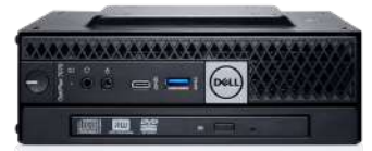
OPTIPLEX MICRO DVD+/-RW ENCLOSURE

Mount your system between two VESA compatible devices. Includes an adapter box to securely house the system's power adapter.