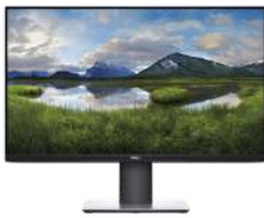
DELL 24 MONITOR - P2419H

23.8" ultrathin bezel optimized for dual display productivity. Easy Arrange feature enables multitasking efficiency and its small base frees valuable workspace.