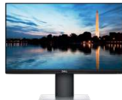
DELL 22 MONITOR - P2219H

23.8" ultrathin bezel optimized for dual display productivity. Easy Arrange feature enables multitasking efficiency and its small base frees valuable workspace.